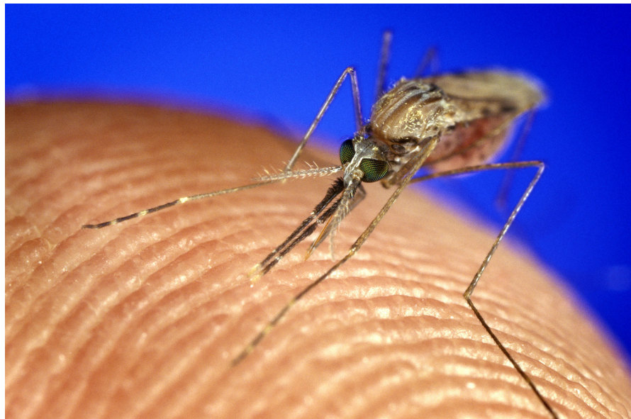
Trends in Ecology & Evolution

Synthetic drive systems have applications far beyond insect population control [92], including agriculture [93], controlling invasive species and pests, or even conservation [92]. We discuss the significant challenges and risks involved in the release of any such drive system in Box 3.